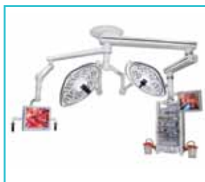
Single Central Mount Light, Monitor, Equipment & Services Pendants