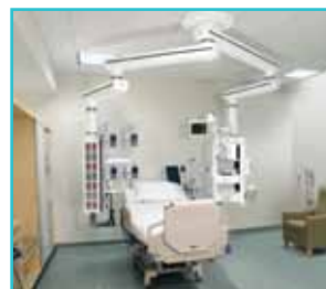
Intensive Care Unit Services Pendants, Monitors, Beds and Clinical Furniture