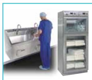
Stainless Steel Warming Cabinets, Scrub Sinks and Storage Solutions