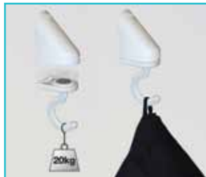
Anti-Ligature Load Release Pliable and Rigid Coat Hooks