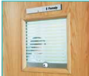
Range of Anti-Ligature Privacy Vision Panels