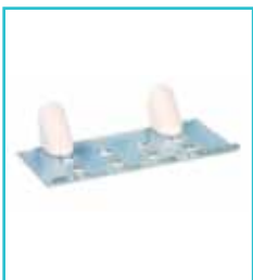
Anti-Ligature Load Release Polycarbonate Shelf Set