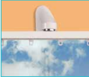
Anti-Ligature Magnetic Curtain Suspension System

General Manager – Private Mental Health Clinic