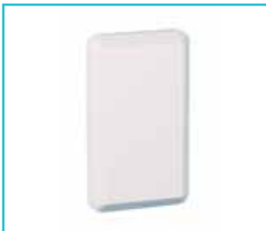
Load Release Anti-Ligature Mounting Plates