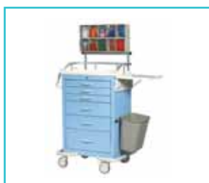
Storage and Workstation Solutions