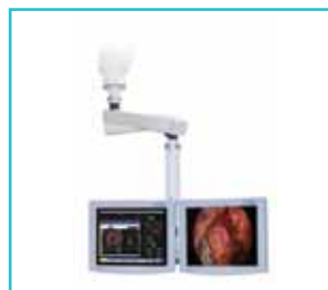
High Definition Surgical Monitors