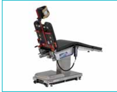
Bariatric, Orthopaedic, Urological, Gynaecological and Ophthalmic Patient Positioning Devices