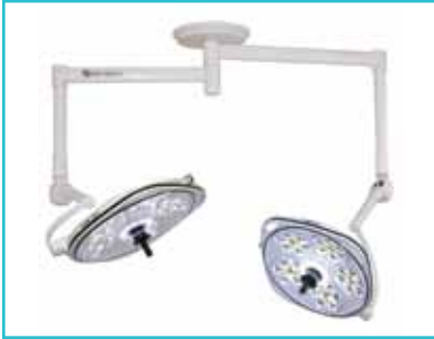
LED Operating Theatre, Examination and Procedure Lighting Systems