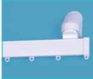
Flexible Anti-Ligature Magnetic Curtain Tracking