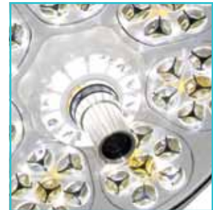
High Definition Room and Light Head Camera Systems