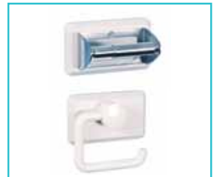
Anti-Ligature Magnetic Toilet Roll Holders