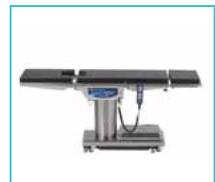
Competitive range of Electro Hydraulic Operating Tables