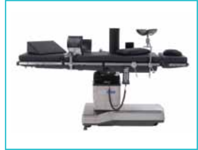
Operating Table Accessories, Consumables and Gel Pressure Care Products