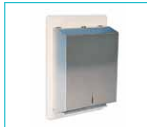
Anti-Ligature Mounting Plates for Soap, Paper Towel and other Sanitary Dispensers