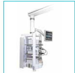
Equipment Carrier Solutions