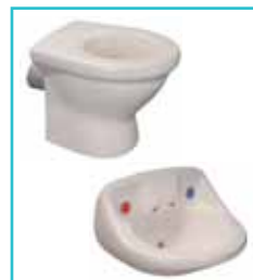
Anti-Ligature and Vandal Resistant Polymer Sanitary Products