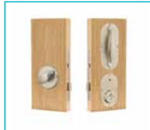
Anti-Ligature Primary and Secondary Anti-Barricade Lockset Solutions