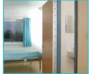
Full Length Single Swinging Anti-Ligature Geared Privacy Hinge