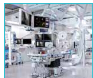
Cath Lab Lighting, Services Pendants, Monitors and Furniture