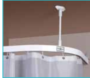
Anti-Ligature Magnetic Shower Track and Screen Suspension System