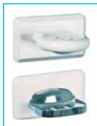
Anti-Ligature Load Release Soap Dishes