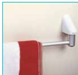
Anti-Ligature Load Release Towel and Wardrobe Rails