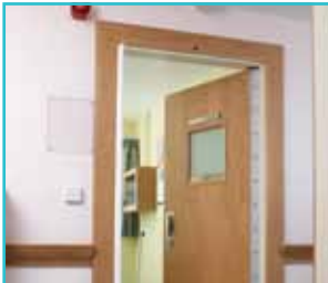
Anti-Ligature Removable Door Stop and Full Length Double Swinging Privacy Hinge Package