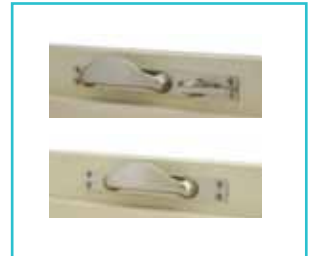
Anti-Ligature Window Handles, Restrictors and Related Hardware