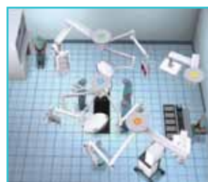
3D CAD Modelling and Equipment Planning Capabilities