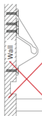
2. Curtain rail should not be mounted above holes/cavities or objects