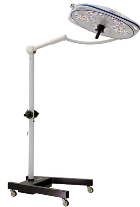
Also available on Mobile Stand