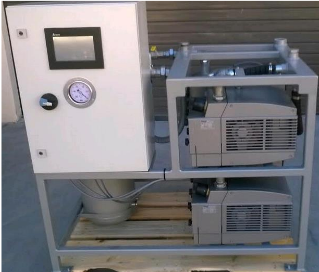
2/3 Pump KVT 3.80_140 System

Unit 5, 8 St Jude Court Browns Plains QLD 4118