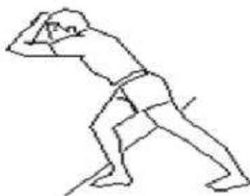
Achilles Tendon Stretch