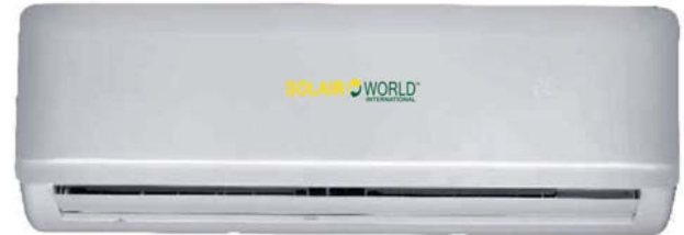
Wall Mount Indoor Unit (IDU)