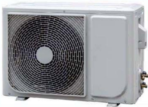
Outdoor Unit (GOU)