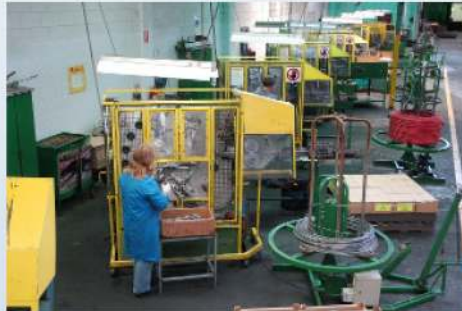
Largest range of MultiSlide Machines