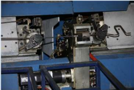
Wire Forming Machine