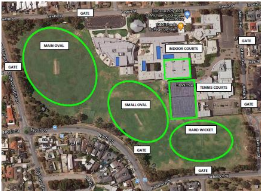
St Michael's College

If there are any queries regarding this weeks' fixtures, please feel free to contact the details below: