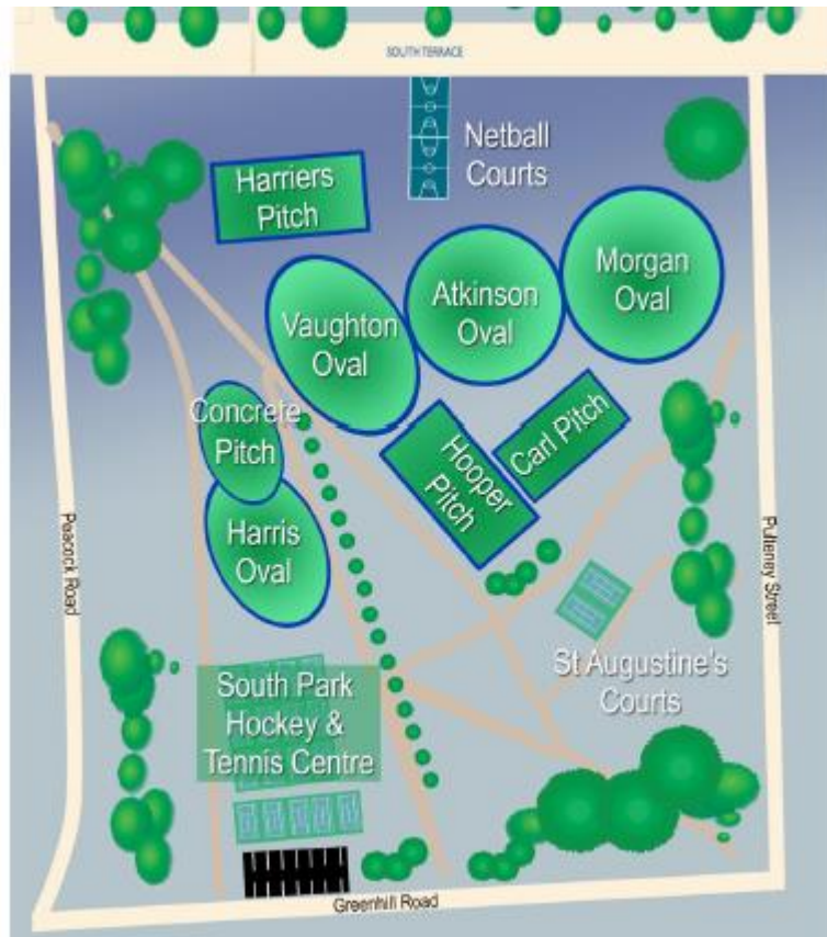
Pulteney Grammar School

If there are any queries regarding this weeks' fixtures, please feel free to contact the details below: