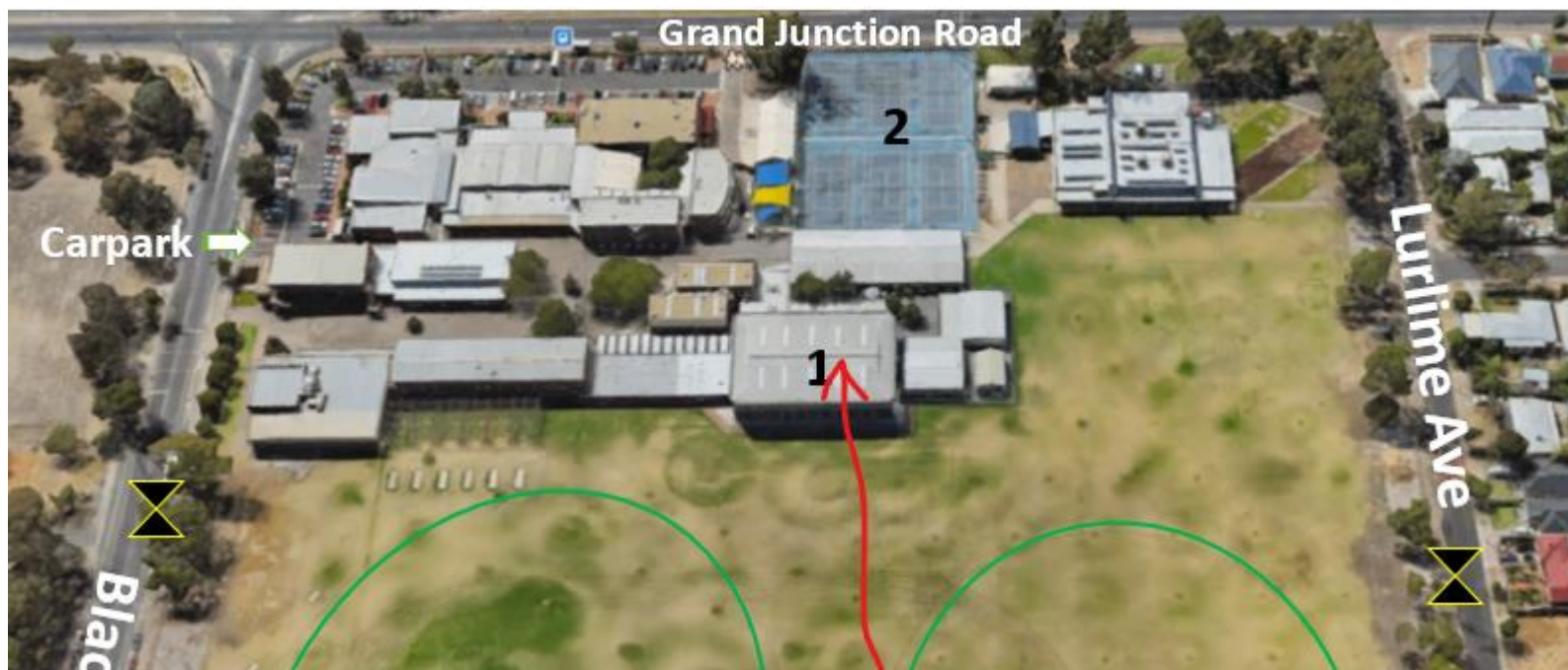
St Pauls Gym

If there are any queries regarding this weeks' fixtures, please feel free to contact the details below: