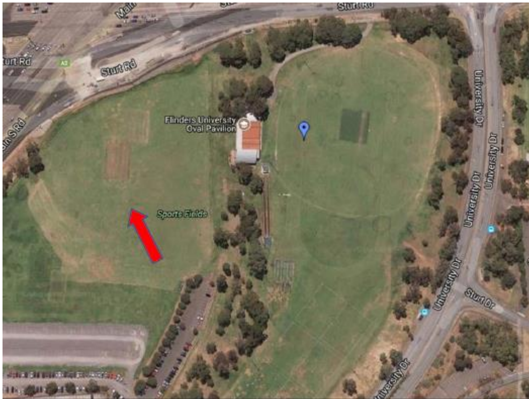
Flinders Uni Oval #2

If there are any queries regarding this weeks' fixtures, please feel free to contact the details below: