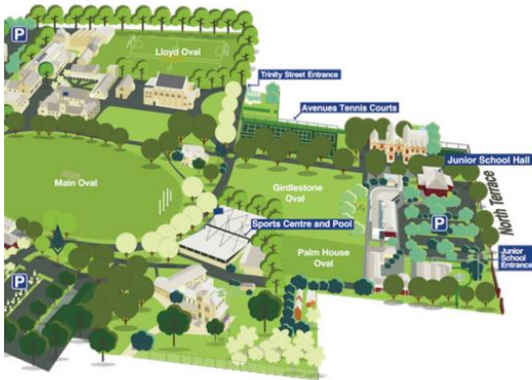
St Peter's College

If there are any queries regarding this weeks' fixtures, please feel free to contact the details below: