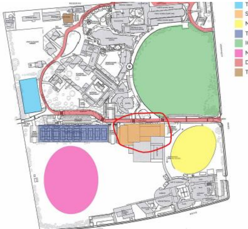
Immanuel College, Sports Centre

If there are any queries regarding this weeks' fixtures, please feel free to contact the details below: