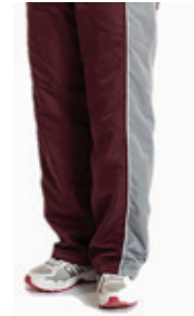
Old tracksuit pant