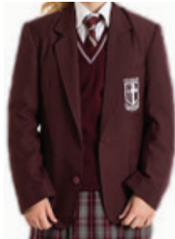
Blazer with old logo and no piping

Please note the below items are long since discontinued, and may not be worn from the end of Term 3 2024. Families are welcome to return discontinued items to the College for donation to communities in need overseas.