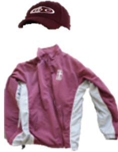
Old cap and track jacket