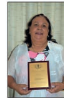
Global Women's Peace Network