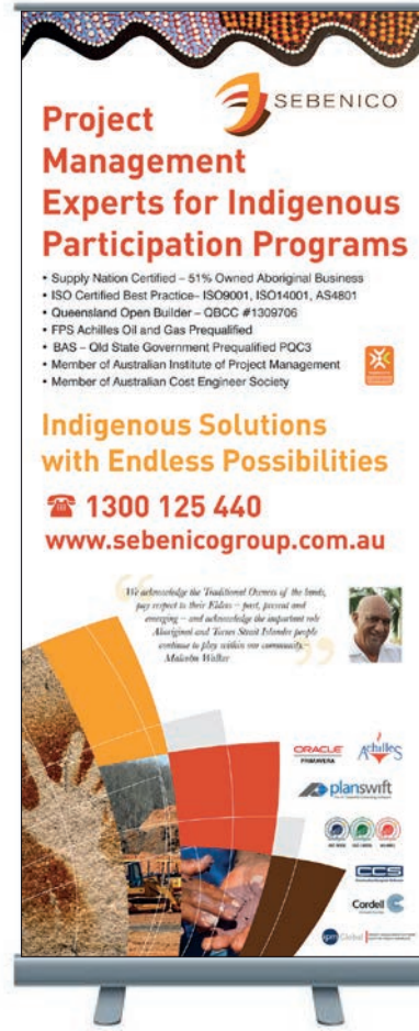
CAPABILITY STATEMENT, PROMOTIONAL FLYERS AND PULL-UP BANNER