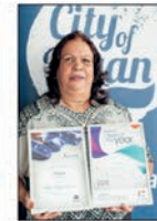
Citizen of the Year 2018