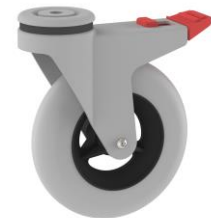
IWHSI Soft Wheel

Polymedic are Australia's Premier trolley manufacturers with all products manufactured here in Australia. Made from our own special formulated composite plastic makes them lighter than metal trolleys, they are easier to push, yet strong and reliable and while keeping within OH&S standards, all Polymedic trolleys are designed and built with the end user in mind. All Polymedic trolleys can be custom modified to suit your requirements. Polymedic use and recommend only quality castors on all our products.