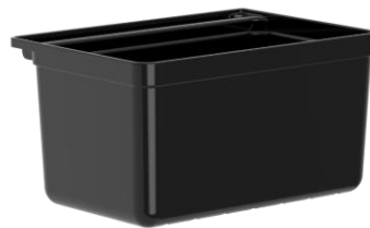
ITADS94 Small Waste Bin