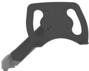
ITADSLAP Laptop Arm