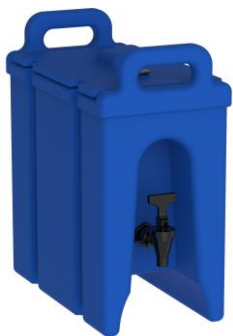
ITADS70 9.4Lt URN