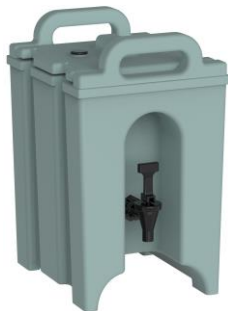
ITADS69 5.7Lt URN