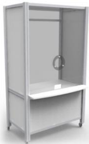
48" Wide, Mobile Option