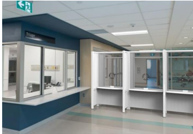
Side by Side Connected