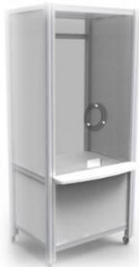
36" Wide, Mobile Option