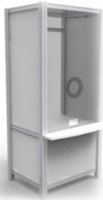
Front Transaction Option