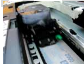
Easy to use – The conventionally grained aluminum plates are imaged in front of your eyes. The PlateWriter™ operates in normal daylight conditions and the plates require no pressroom changes.