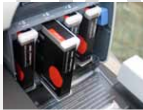
The PlateWriter™ 2000 is powered by the industry standard Harlequin Postscript RIP accepting jobs from Mac or PC in Postscript, PDF, EPS, TIFF & JPEG formats - handling your job, ripping it and outputting it directly to the PlateWriter™.