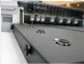
The use of advanced inkjet technology eliminates the use of any processing chemistry. No mess - no fuss.