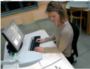
The PlateWriter™ 2000 features a semi-automatic plate alignment system to ensure accurate registration and transport through the imaging engine.

The finishing unit includes a built-in gumming station to finish the plates for storage or immediate use on press. The daylight operation and chemistry free approach makes iCtP the ideal low maintenance platemaking solution.