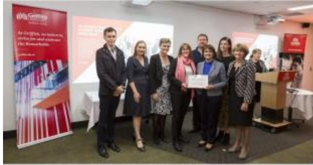
AVATAR for Invasive Access Training and Research Award - Meridian Health Institute of Queensland