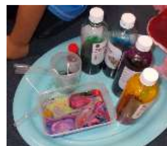
Magic Milk Experiment