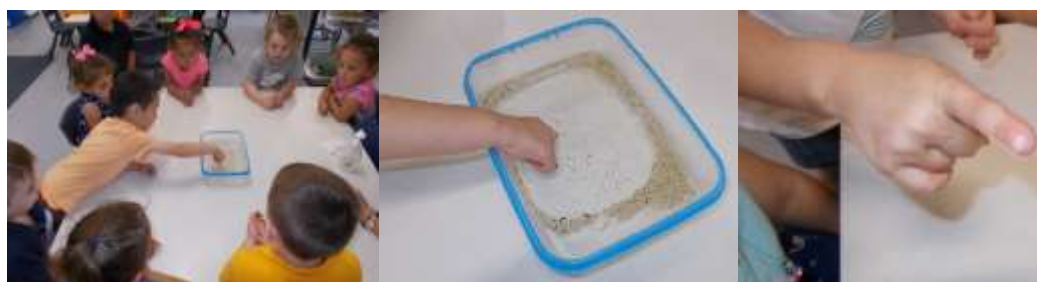
The Germ Experiment