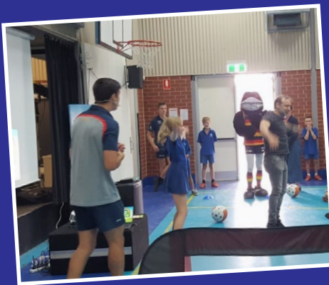
Growing with Gratitude Program