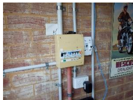
No termite barrier notice