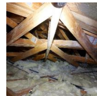
Insulation obscured timbers