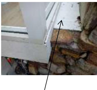
Drill hole from termite barrier application