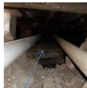
Limited clearance in subfloor access point