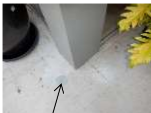
Termite monitoring station