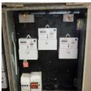
No termite barrier notice