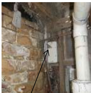
Old termite baiting station /workings