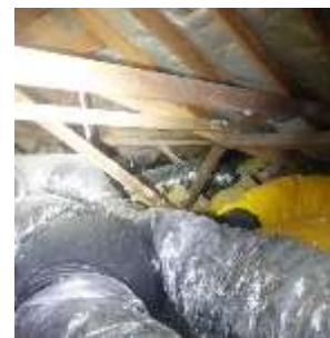
Insulation obscured timbers