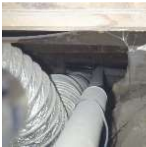
Limited clearances/Ventilation fan duct