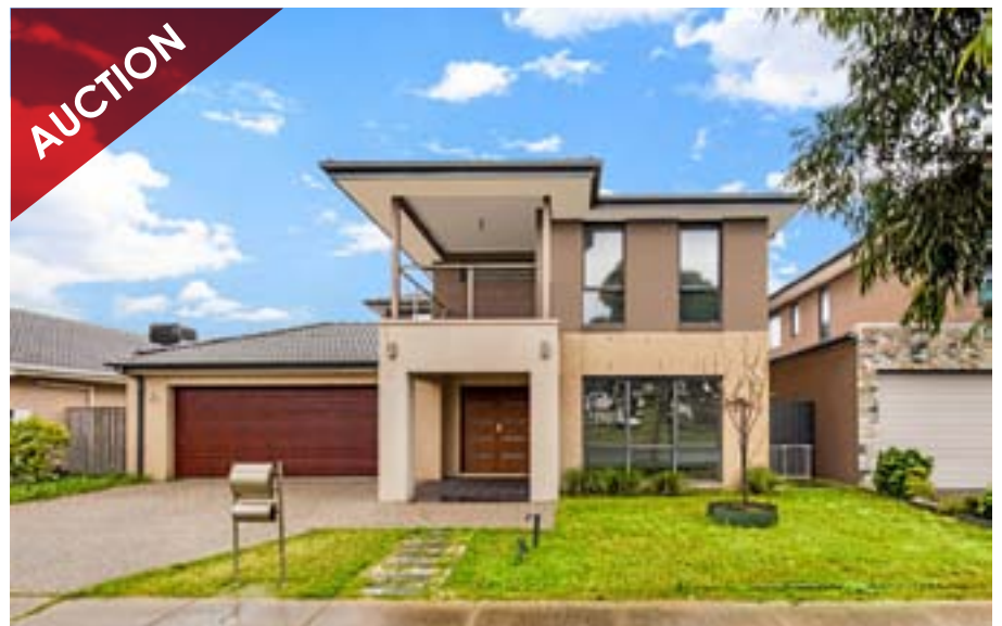
AUCTION Saturday 9th Nov at 12:00pm