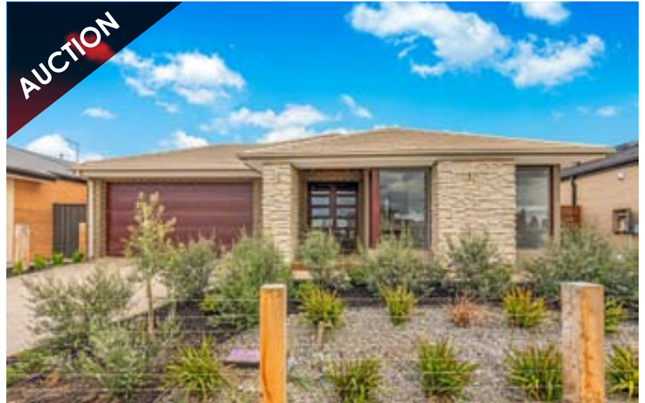
AUCTION Saturday 26th October at 11:45am