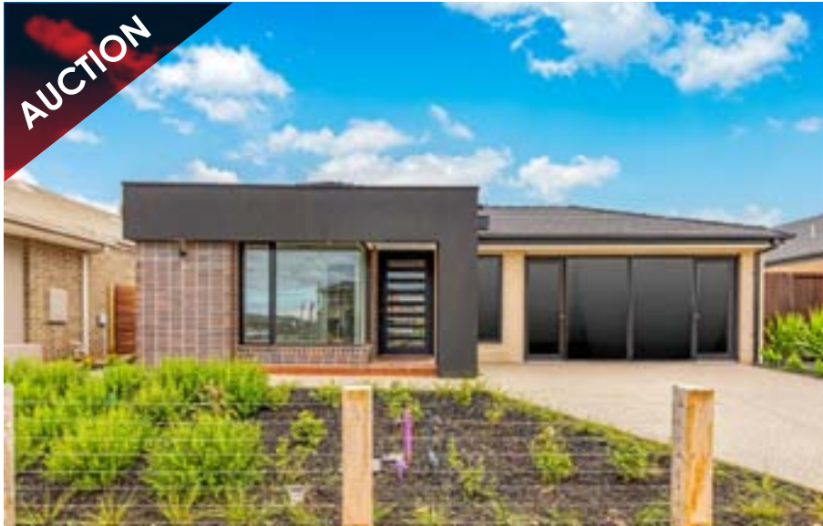
AUCTION Saturday 26th October at 11:00am